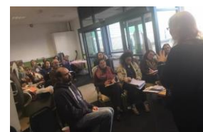
A snapshot of some of our Creative Entrepreneurs who attended the workshop and showcase.