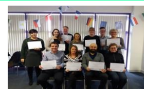
Pictured are our YCM European Project Partners who attended the 2 nd International Meeting in Roscommon recently