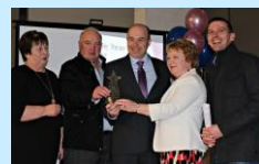
Roscommon Association Supporting People with Special Needs, winners of the Group of the Year award, with Minister Denis Naughten.