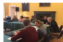
Members of the YCM Regional Alliance who attended a recent meeting in King House, Boyle, Co. Roscommon.