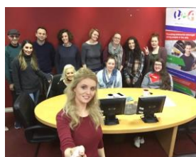
Participants from Roscommon attending the YEA Train the Trainer in Dungannon Enterprise centre, Dungannon Co. Tyrone, Northern Ireland recently.