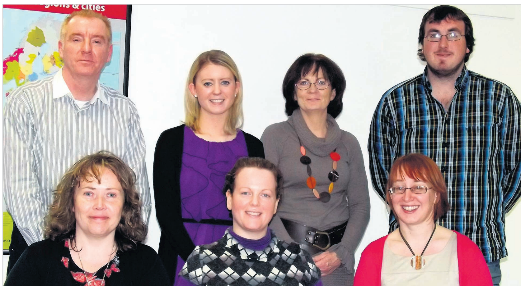
LEADER Team at Roscommon LEADER Partnership