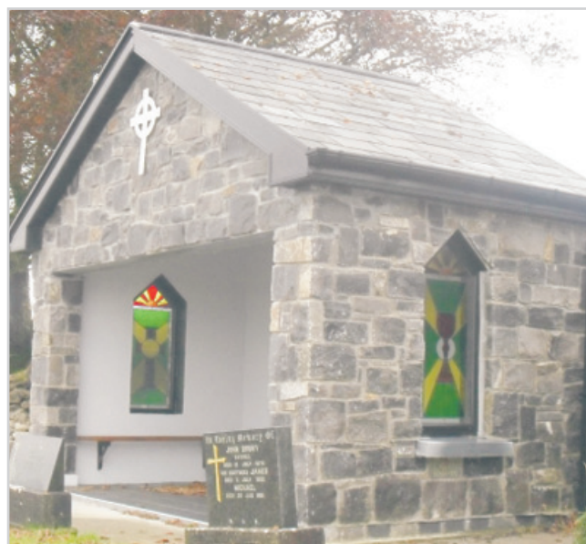
Left: Grotto completed in Fairymount Cemetary a great example of Environmental Maintenance Work carried out by Rural Social Scheme Participants in the area